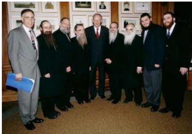
Canada - Prime Minister Jean Chretien